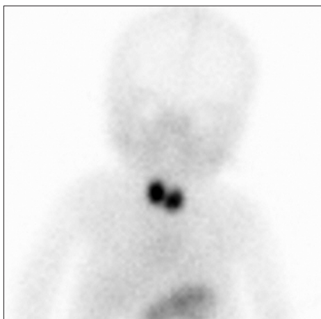
Figure 1: ^{99m}\text{Tc} thyroid scan- enlarged thyroid gland with increased avid tracer uptake